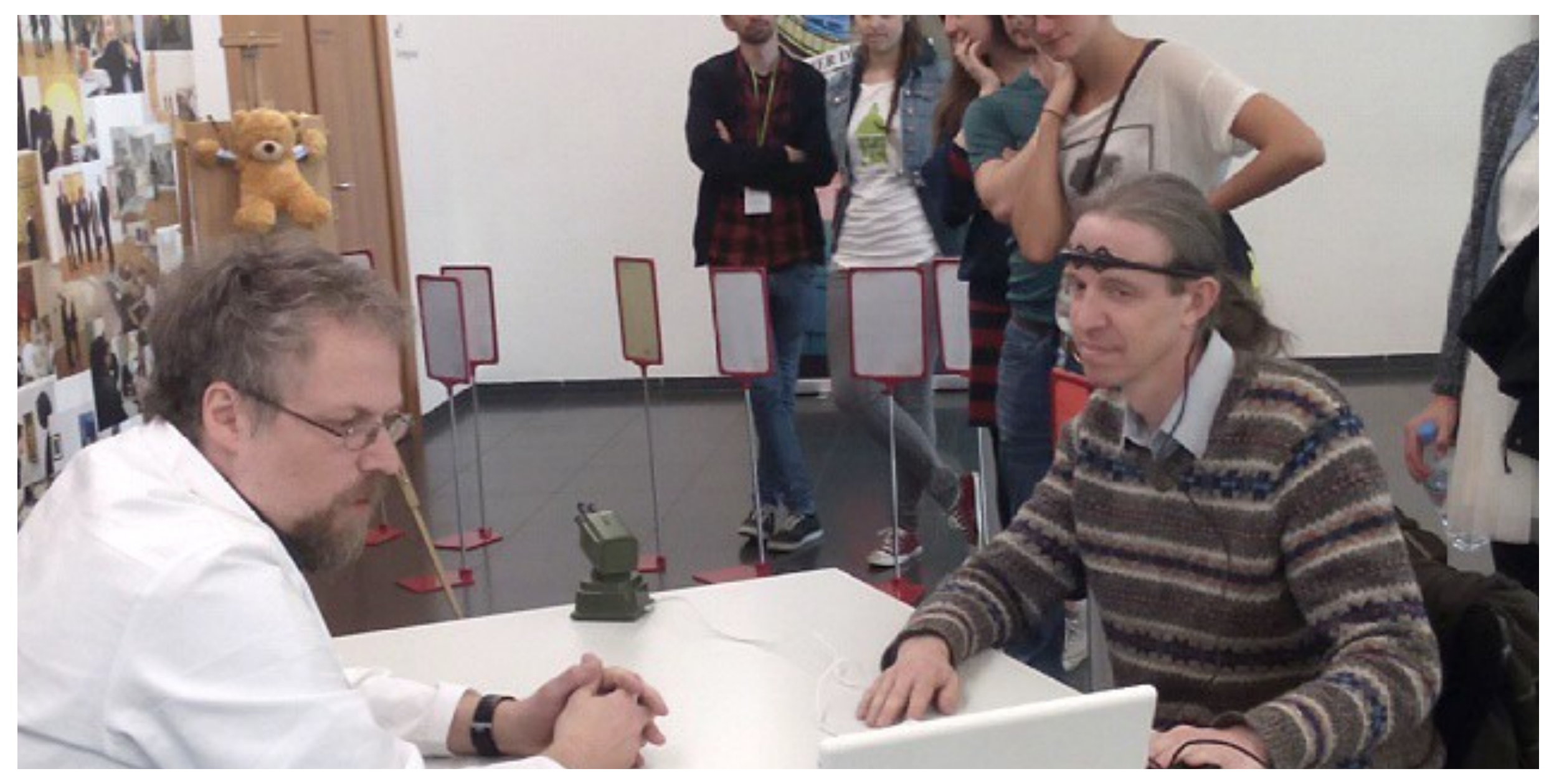
SPIEL 1 at playin' Siegen